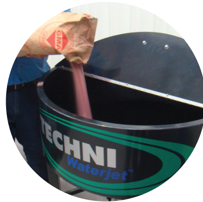
Easy Load Setup