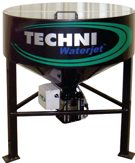
500 Kg (1100 lbs)

The hinged lid on the hopper system allows easy access to inspect and fill at any time, without the need to de-pressurize. The clear pump chamber allows a quick visual to ensure abrasive is present and flowing correctly.